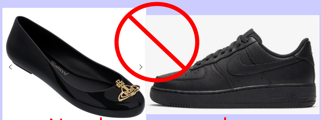
No adornments or logos

Excellence is: Being Ready, Resilient, Respectful