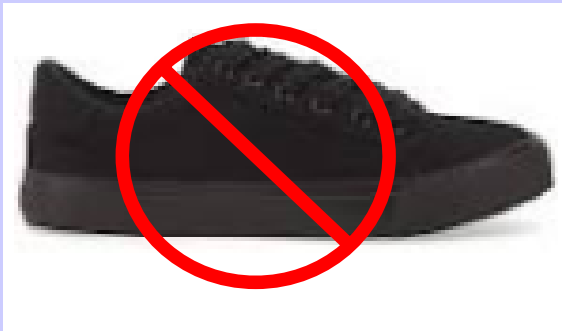
No Canvas Shoes